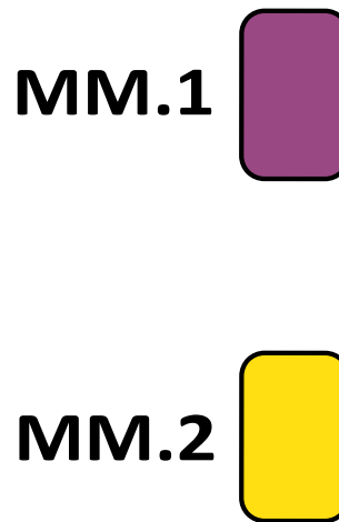
Top of antenna